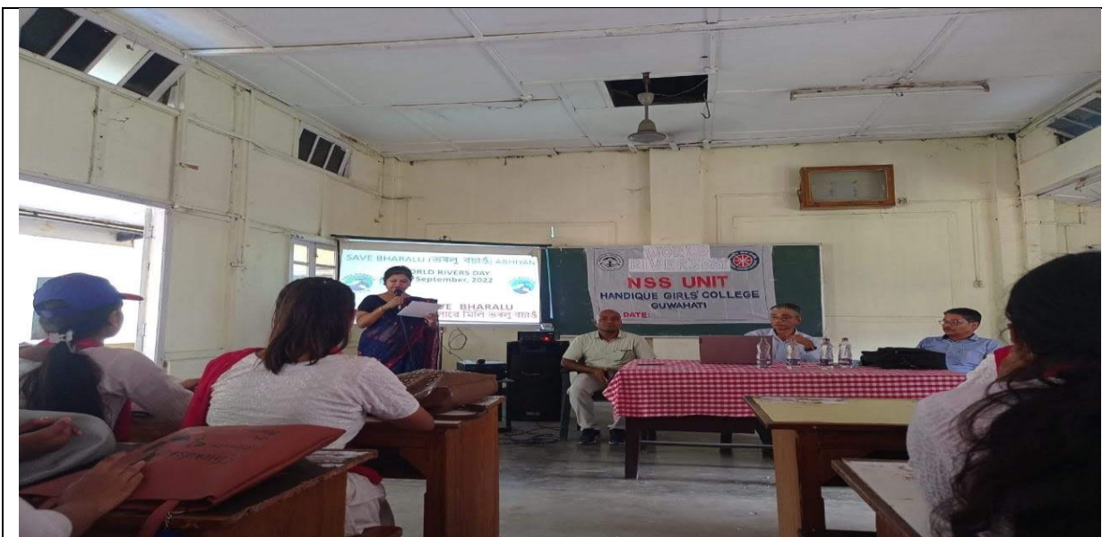
Save Bharalu Abhijan: World Rivers Day , Awareness programme organized by NSS unit in collaboration with Save Bharalu Abhijan