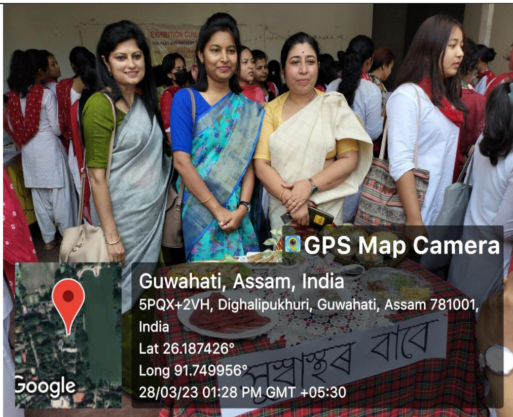
An exhibition cum sale organised by the alumni of the Department of Philosophy to raise funds for a social cause