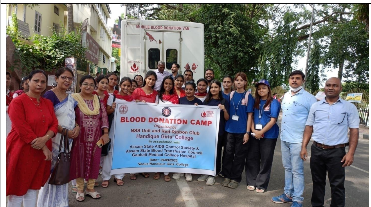
Blood donation camp organized by NSS unit and Red Ribbon Club in association with Assam State AIDS Control Society and Assam State Blood Transfusion Council and Gauhati Medical College Hospital