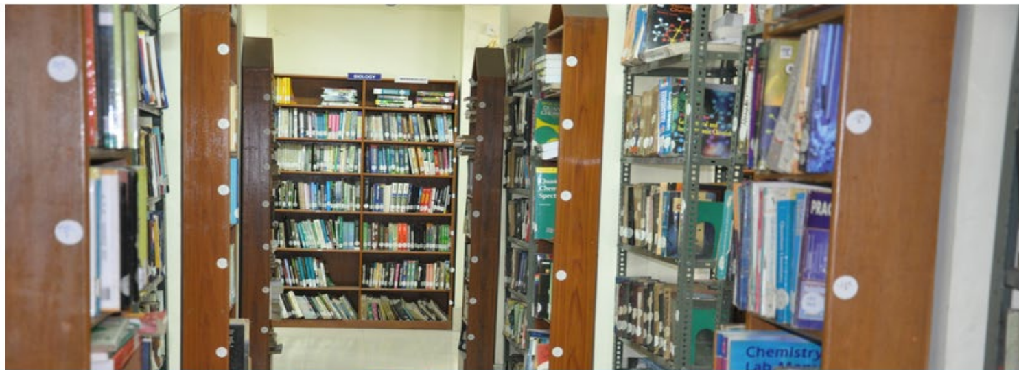
Digital Library Cum Institutional Repository (Home Page)

Handique Girls' College Institutional Repository